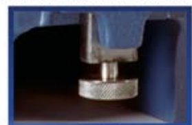
Precision Threaded Screws for Depth of Impression