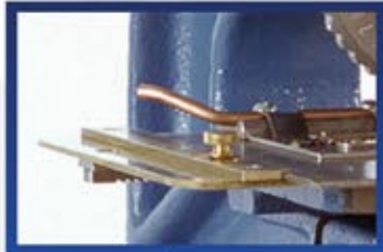
Precision Machined Spacing Rack