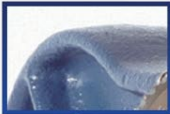
Sturdy Cast Iron Frame. Prevents deflection to prevent uneven marking.